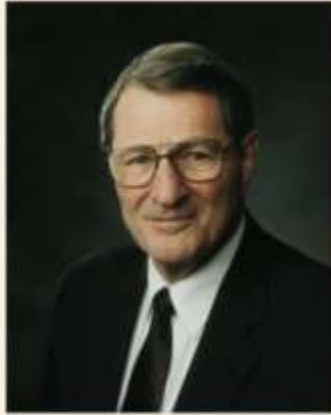
Elder Neal A. Maxwell

On the other side of the veil, there are perhaps seventy billion people. They need the same gospel, and releases occur here to aid the Lord's work there. Each release of a righteous individual from this life is also a call to new labors. Those who have true hope understand this. Therefore, though we miss the departed righteous so much here, hundreds may feel their touch there. One day, those hundreds will thank the bereaved for gracefully forgoing the extended association with choice individuals here, in order that they could help hundreds there. In Gods ecology, talent and love are never wasted. The hopeful understand this, too. [34]