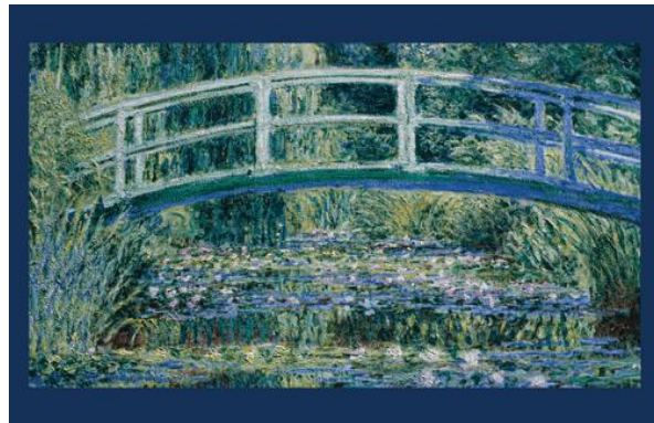
Water Lilies and Japanese Bridge, 1899, by Claude Monet

This amazing place is the result of the creative passion of one man: the great painter Claude Monet, who, for 40 years, tenderly shaped and cultivated his garden to make it his painting workspace. Monet immersed himself in nature's splendor; then, with his paintbrush, he conveyed the impressions he felt with strokes of color and light. Over the years, he created an extraordinary collection of hundreds of paintings, directly inspired by his garden.